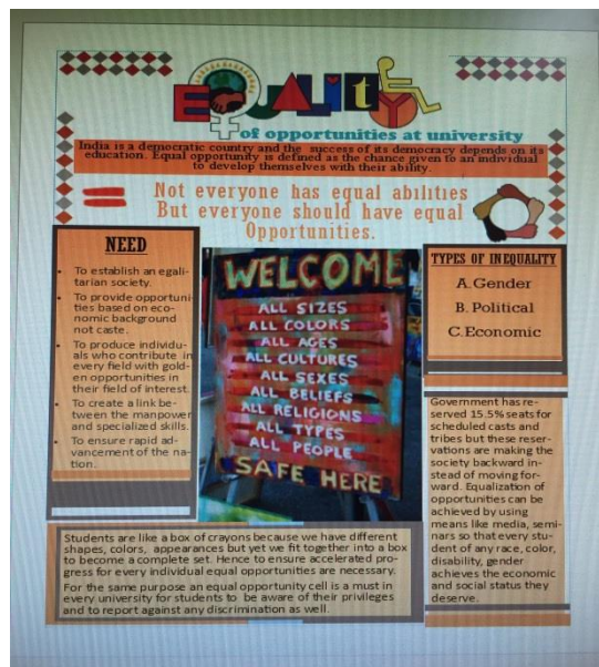
Poster prepared by student