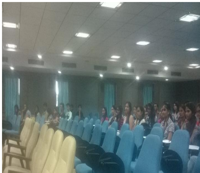
Students attending the session