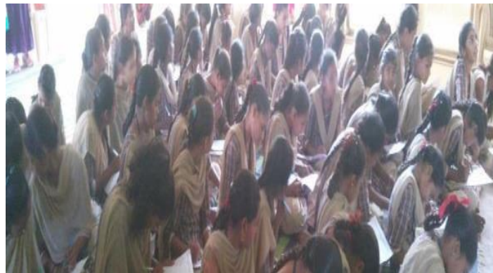
Awareness on Menstrual health and hygiene