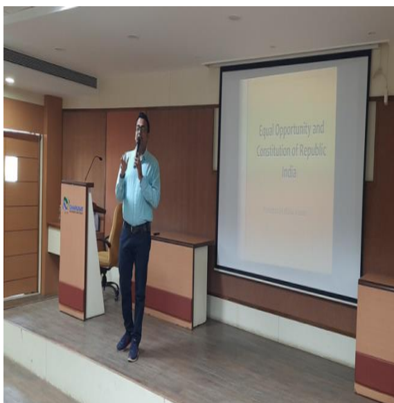
Expert talk on Equal Opportunity and the Constitution of India

Cross cutting issue covered: Professional ethics, Human values