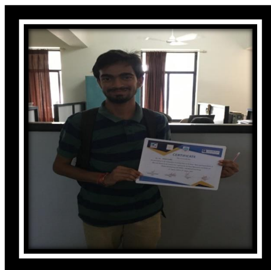
Students receiving participation certificate in CMPICA staff room