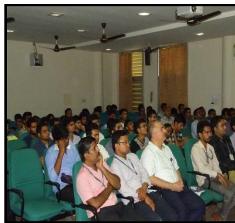
Participants (Faculties and students of Charusat) for the Expert Talk EC seminar Hall, Room 212