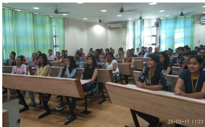
Students participated in expert talk