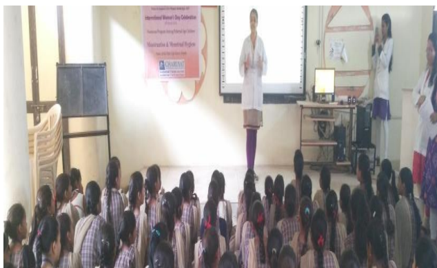
Awareness on Menstrual health and hygiene

Outcome of the activities: It served a platform for the female students to share their views and clarify the concept of menstruation in depth under the guidance of Women Development Cell faculty.