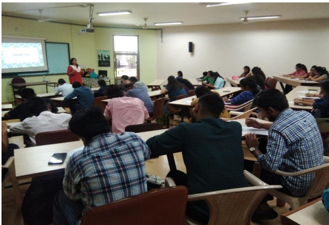
Expert talk on Gender Mainstreaming