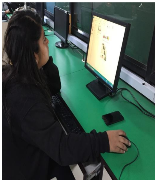
Students preparing the poster on the theme through Microsoft publisher in the computer lab during the time